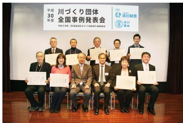
Award ceremony (Tokyo, Jan. 2019)

JRRN received the "Excellent Achievement Award 2018" from the River Foundation for the grant project "Human Resources Development through field training on Collaborative Nature Restoration".