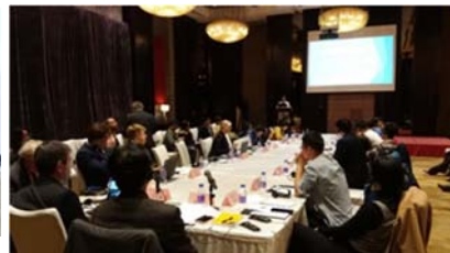
Sino-Europe Workshop on Basin Water Resource Integrated Management: December 6, 2017, Beijing, China.