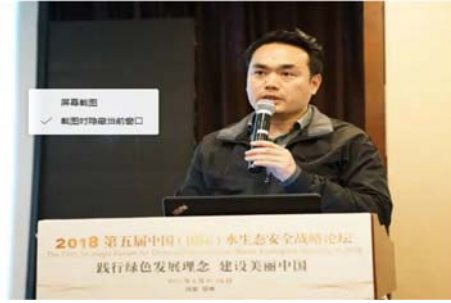
The 5th China (International) Forum on Strategy of Water Ecology Security: April 12-14, 2018, Zhengzhou, China.