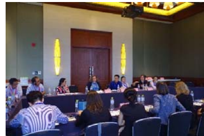
The 13th Qingdao International Water Conference: Water --- Sources of Life & Base of Development. June 26-29, 2018, Qingdao, China.