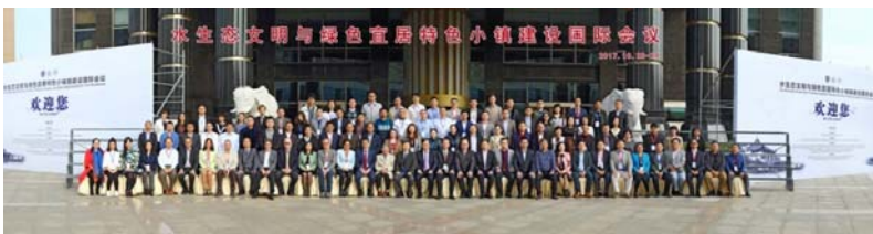
International Conference on Eco-Civilization of Waterfront and Construction of Small Green Livable Towns. October 27-29, 2017, Suzhou, China