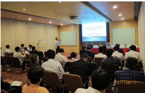
The 14th International River Ecological Restoration Forum : August 17, 2017, Kuala Lumpur, Malaysia