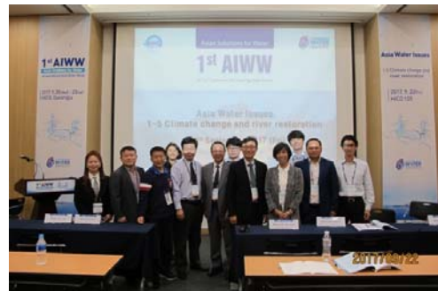
The First Asian International Water Week : Climate Change and River Ecological Restoration, Sept. 20, 2017, Gyeongju, South Korea