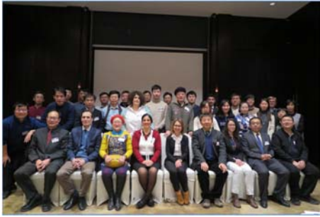
Sino-Europe Workshop on River Ecological Restoration Methods and Standards: February 6-7, 2018, Beijing, China.